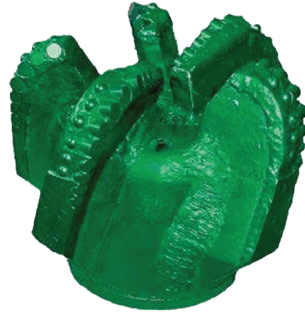
BS-393,7 VD 519-003