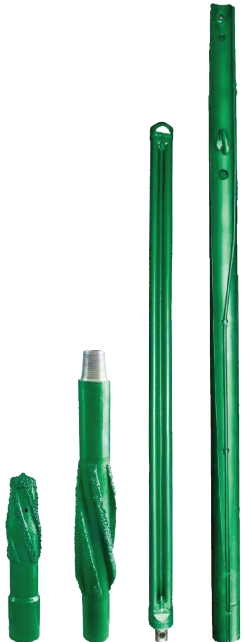
KOT-146 OGN 1